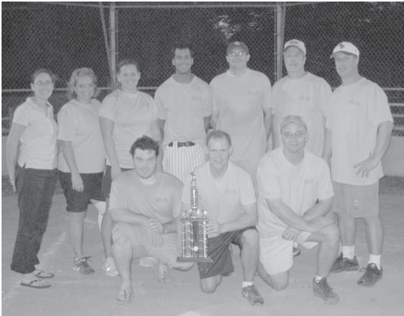
AABA 2008 Softball League Champs, North County