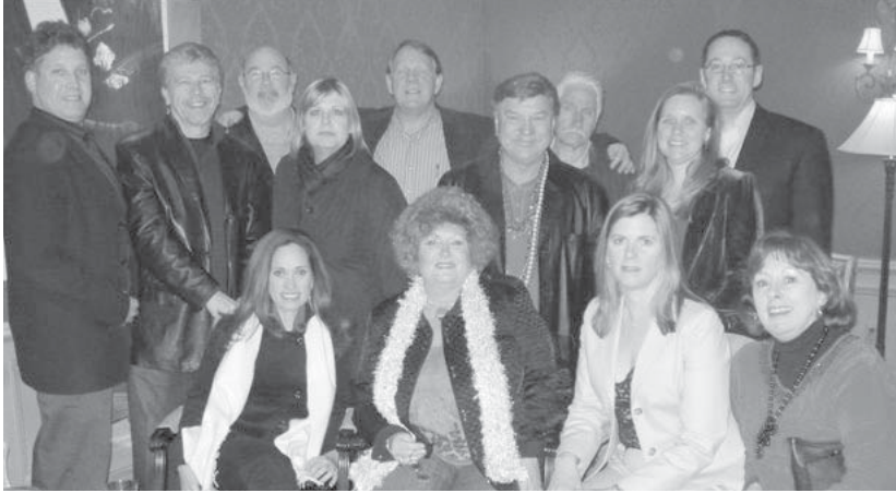
AABA Members and guests visited New Orleans in January

we had to turn away people because of space constraints. Be sure to get your team registered ASAP. The cost is $30 per person and includes a buffet dinner. The proceeds from this event