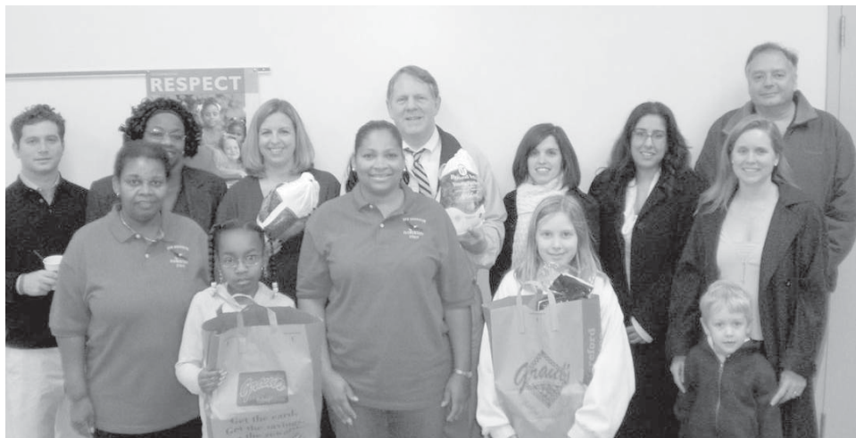
Many thanks to our on site volunteers.

While we will not be able to eliminate identity theft, we can take steps to make sure our information and our client records are as secure as possible.