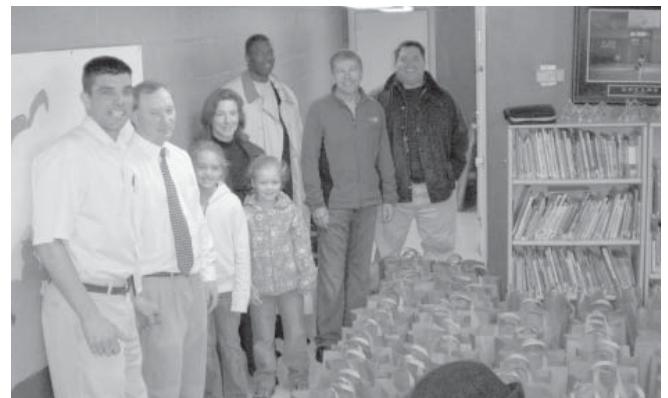
Thanks to all who contributed to and helped with the annual turkey dinner distribution -- it was a great success.

offline. From dumpster diving – or going through trash to find documents with personal information – to stealing incoming postal mail from unlocked mailboxes and “shoulder surfing,” or sneaking a look behind a victim's back at an ATM, there are many ways creative thieves can find personal information.