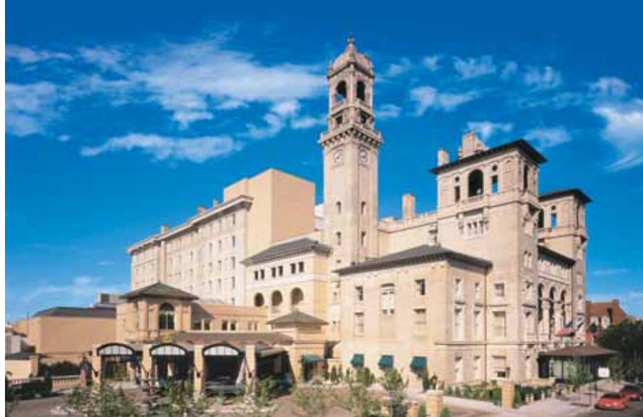
The Jefferson Hotel in Richmond, Virginia, site of the 2011 Bar Weekend

The leaves have turned color and fallen as autumn comes to a close. The season has been a busy one for the AABA. Our Young Lawyer's were off to a great start, holding their first happy hour of the season on September 29th at the Latin Quarter on West Street. With the warm weather having held on through September, those margaritas and the like went down well. In November we had a number of very successful events. I was glad to see so many out on November 8 for our Charity Pub Quiz at Galway Bay. Not that I was any standout at the Pub Quiz up against some of the best “ringers” in the business but the laughter and fun we all had there made it all worthwhile as a diversion. Nineteen teams and 108 members matched wits and shared lots of laughs. The competition was fierce, but at the end of